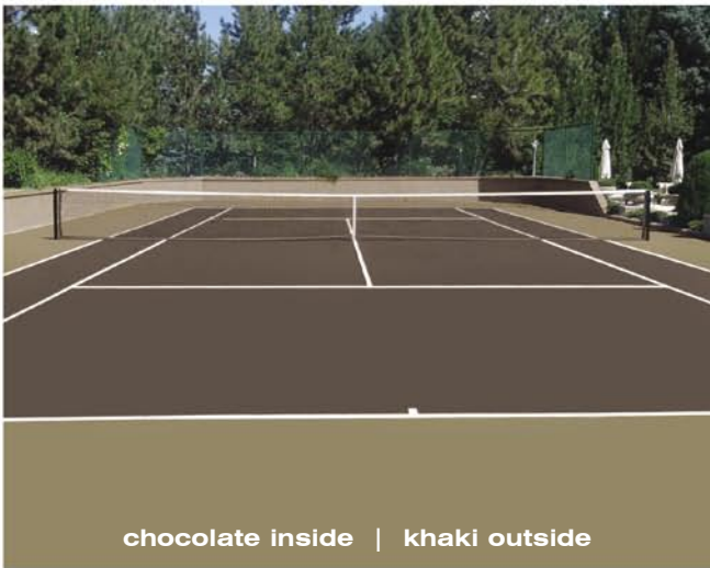
chocolate inside | khaki outside