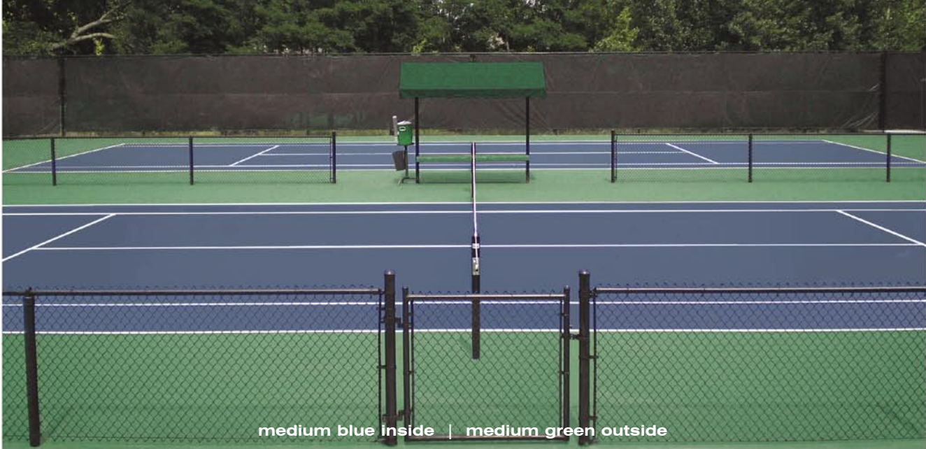
medium blue inside | medium green outside