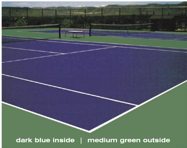
dark blue inside | medium green outside