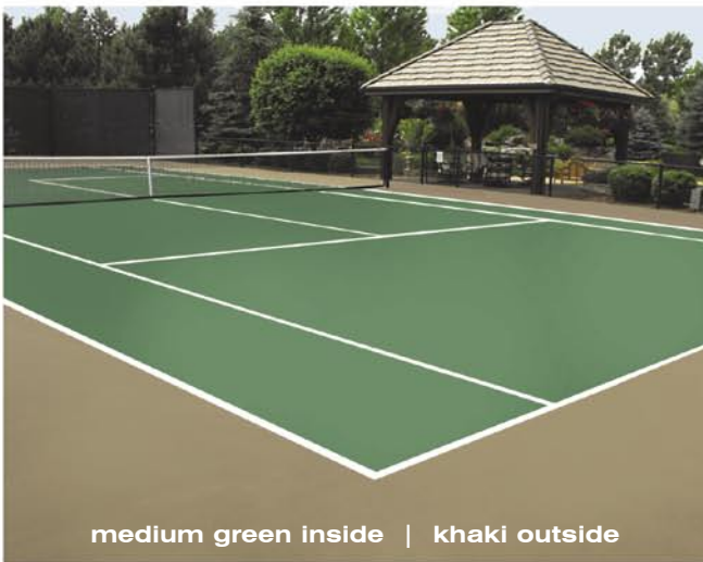
medium green inside | khaki outside