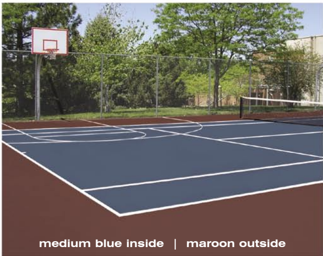
medium blue inside | maroon outside